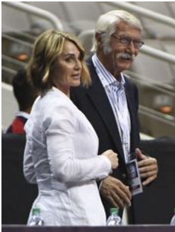
Nadia Comaneci and Bella Karolyi at the U.S. Olympic gymnastics trials. 2016