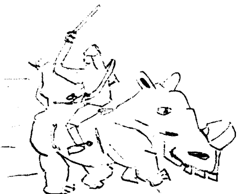
Charging in where others have already been.