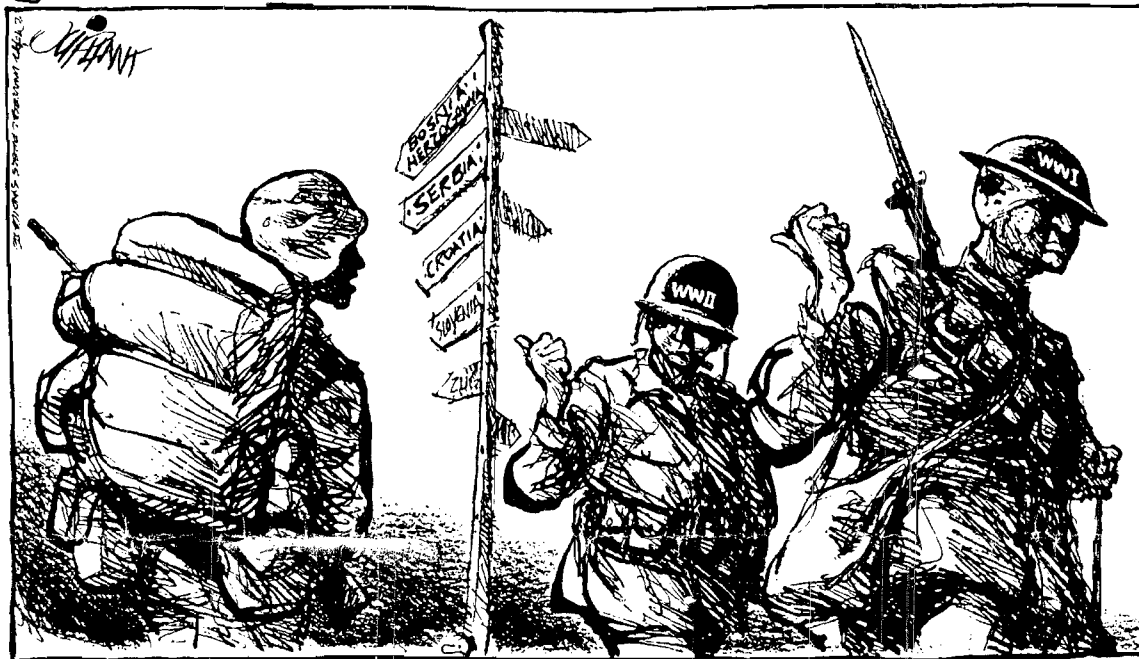
'PARDON ME - WHICH WAY TO THE QUAGMIRE?'

This cartoon on Yugoslavia particularly impressed me, as I've seen the "WW I" soldier cartoon somewhere else before (perhaps at the Imperial War Museum in London), and the "WW II" soldier is pure Bill Mauldin. It makes you wonder how many times do you have to do a job before it's finally finished.