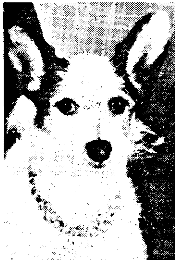
Spot the Wonder Dog He knew the real 'dogs'