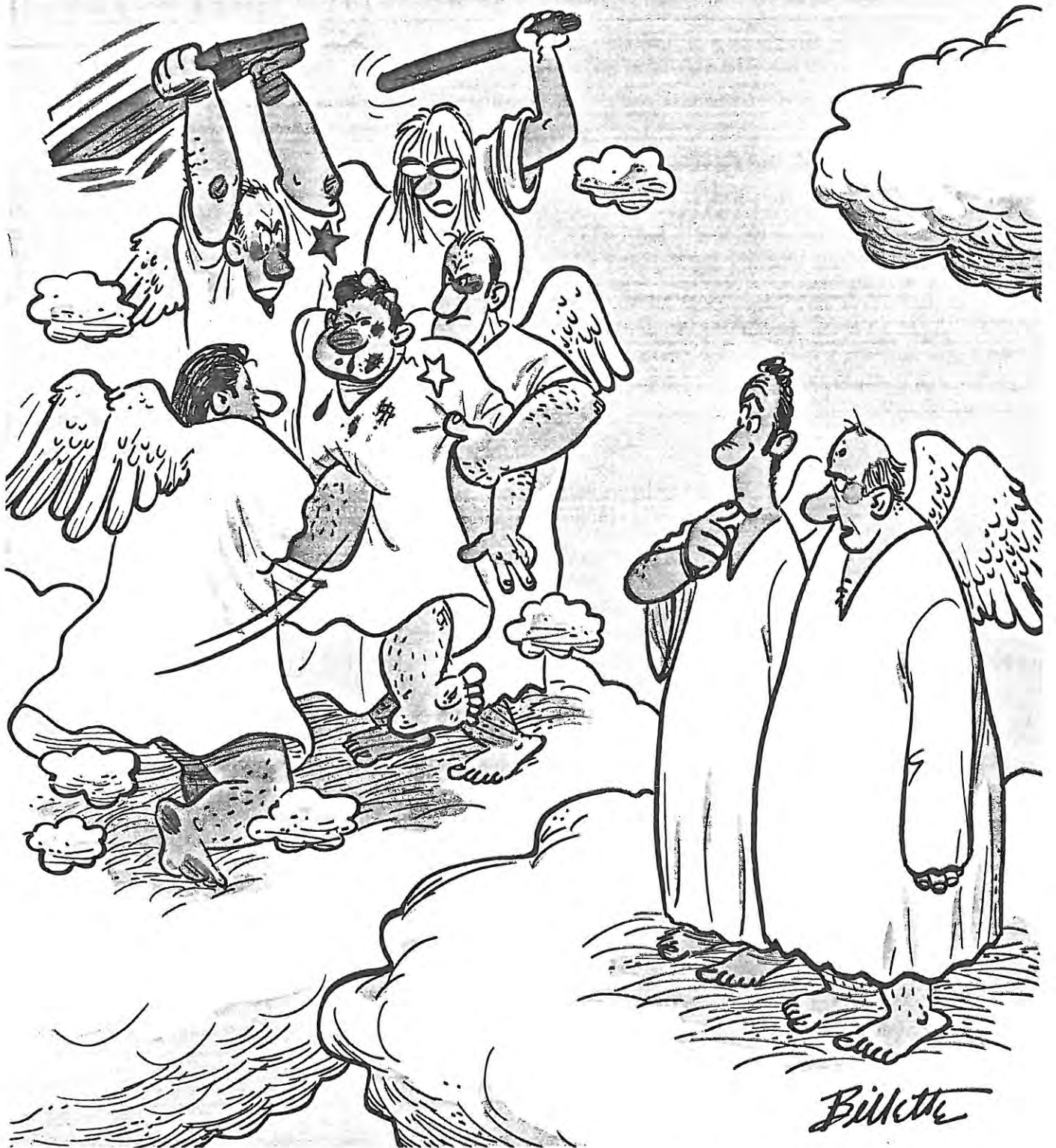
"Oh, that's just a bunch of lung-cancer victims getting back at a tobacco farmer."