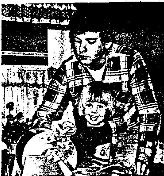
Me and a helper