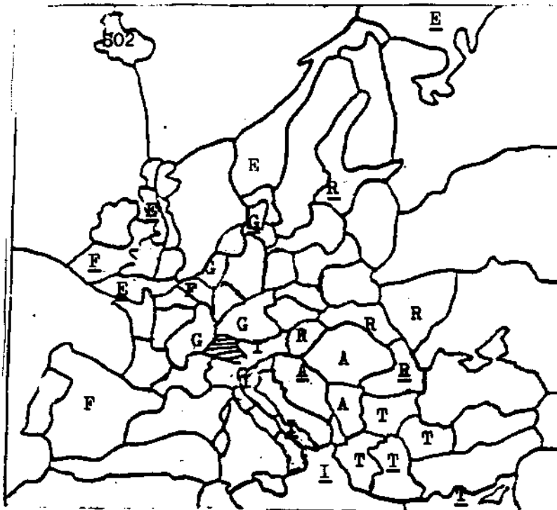
POSITIONS IN SPRING 1902

10 FRANCE PREMIER RETURNS TO FRAY!! AUSTRIA BESIEGED!!!