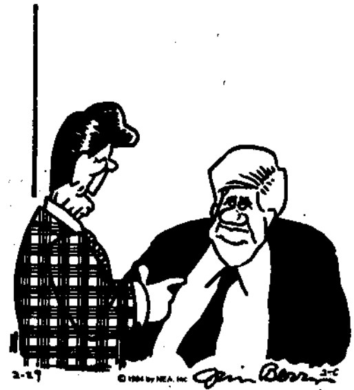
"Have you heard the good news about the unemployment rate?"