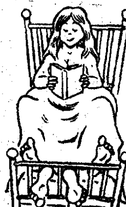
Snuggle up with a good book

Russia in the good old days. A little war. A little peace. And lots of horsing around.