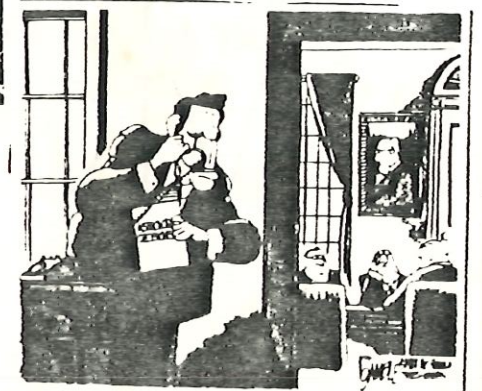
NANCY, FORGET IS IT WHEN URANUS IS ALIGNED WITH PLUTO AND SATURN THAT WE PARDON OLLIE