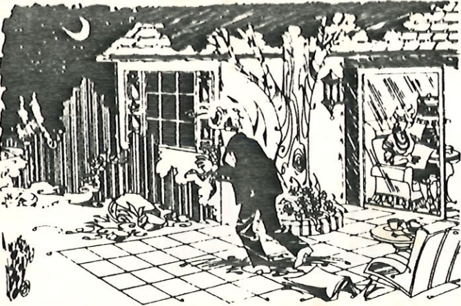
'Sell the stock, get the kids into the bomb shelter, and turn on Reagan's press conference — Mars is aligning with Jupiter!'