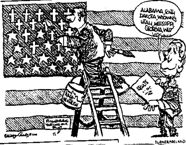
THIS MODERN WORLD By Tom Tomorrow

This last suggestion prefigures the fate of President Bush's apparent plan to reformulate the government of the United States of America on what he, and the presently dominant faction of the Republican Party, imagine to be Christian principles. This can only serve to bring Christianity into disrepute, as Islam is now in disrepute among the younger