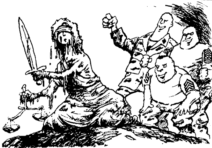
"CHAPTERED OUT" AT CAMP BUCCA