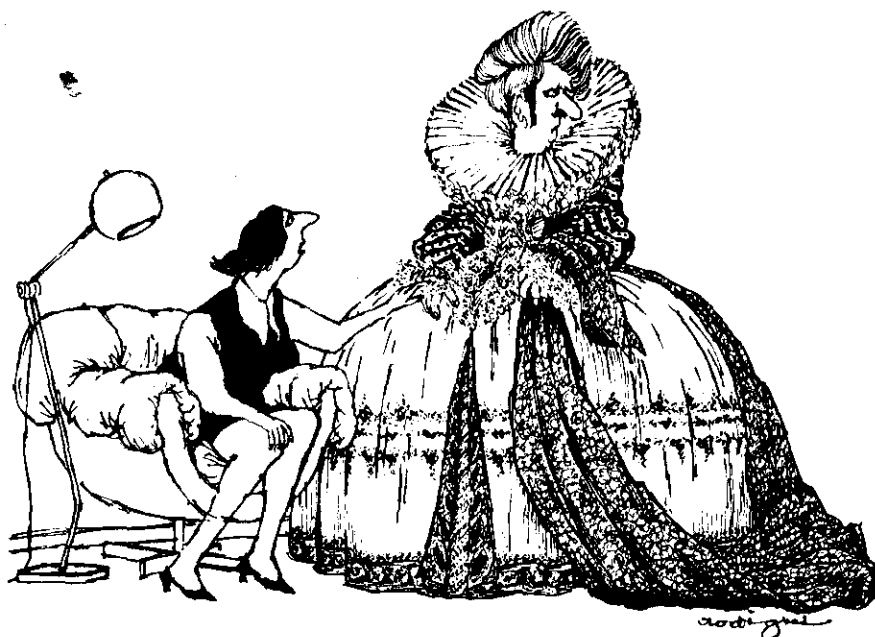
Jack's wife pleads with him not to play England in 1981C- The Snake Pit