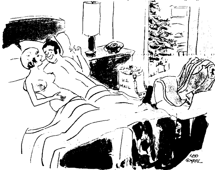
You all wondered how she did so well in this postal hobby!!