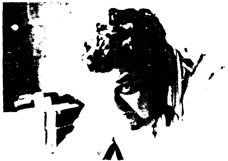
HE WIPED OUT BOTH OF US????