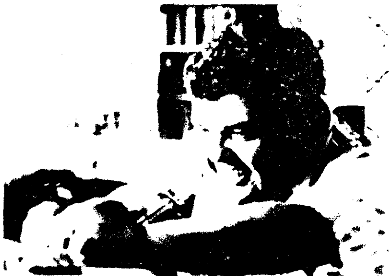
THROW THE BRICKS! BLAST! BLAST! FIRE!