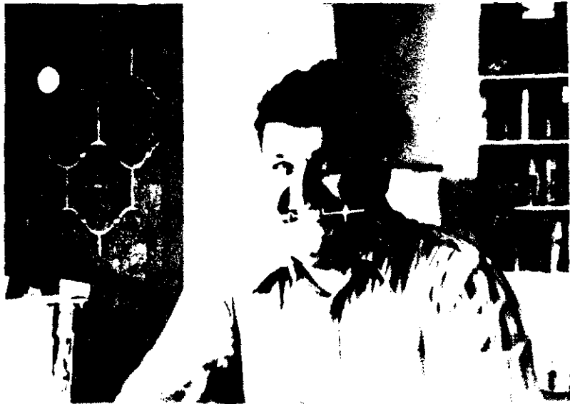
SLURP! FRESH POLISH TANKS TO THE SLAUGHTER!