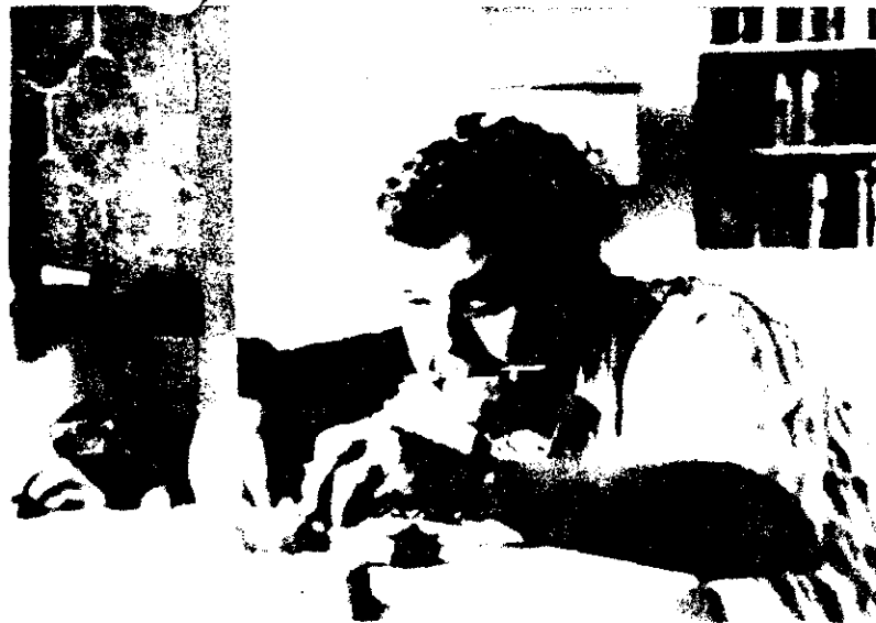
O.K., EDI, YOU HIT HIM THERE AND I'LL CRUNCH HERE!