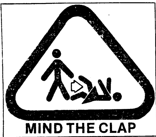
To familiarise the general public with the dangers of sexually transmitted disease, these warnings will soon be appearing at all TTC subway stations.