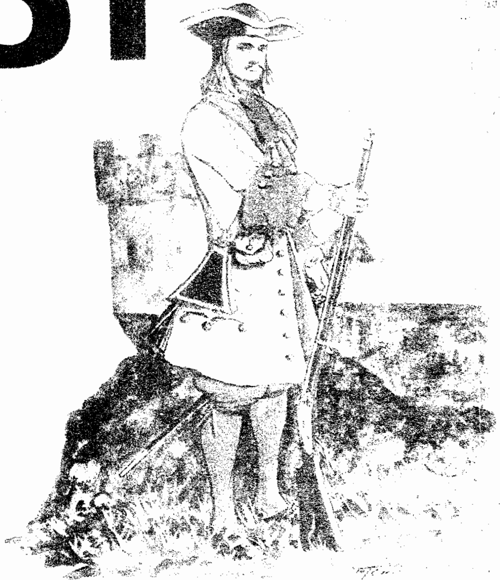
Troopmaster, 1699 Revolunt Regiment, 1699