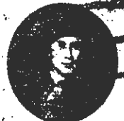
John Paul Jones US Bicentennial 15c