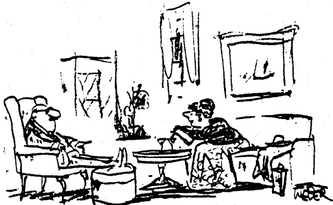
"There we are. Now let's hear your dispatch from the front."