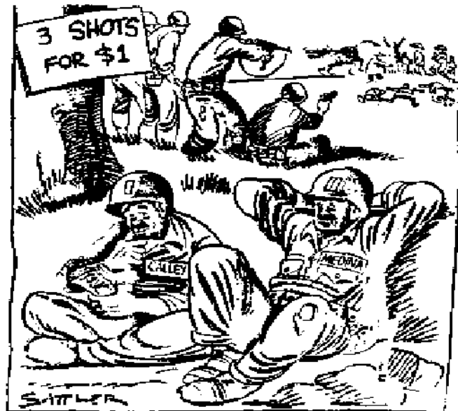
See, Willie, I guess this is what the army means by "individual initiative."