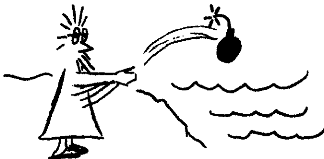
THE SUPREME ANARCH PARTING THE WATERS!

Due to the call to duty, your tired (and deaf) gamesmaster will not be within reach of anybody for the first two weeks of July. I shall have a military address, but I anticipate that mail delivery will not be reliable enough to justify publishing a temporary address.