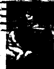
Appel, 149-1981, National Gallery