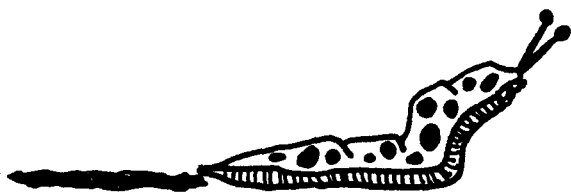
DOO DAH - THE WONDER SLUG