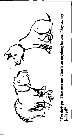
"I'm their pet. They love me. They'll do anything for me. They can my balls off."

Dear Fido: Whenever my person has friends over for a gaming session, I get ashes and beer dumped all over me (sometimes on pretzel falls to the floor, it's quickly snatched up before I can get it. I want revenge, what can I do? -Steaming in Syracuse