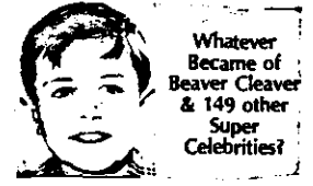
Whatever Became of Beaver Cleaver & 149 other Super Celebrities?