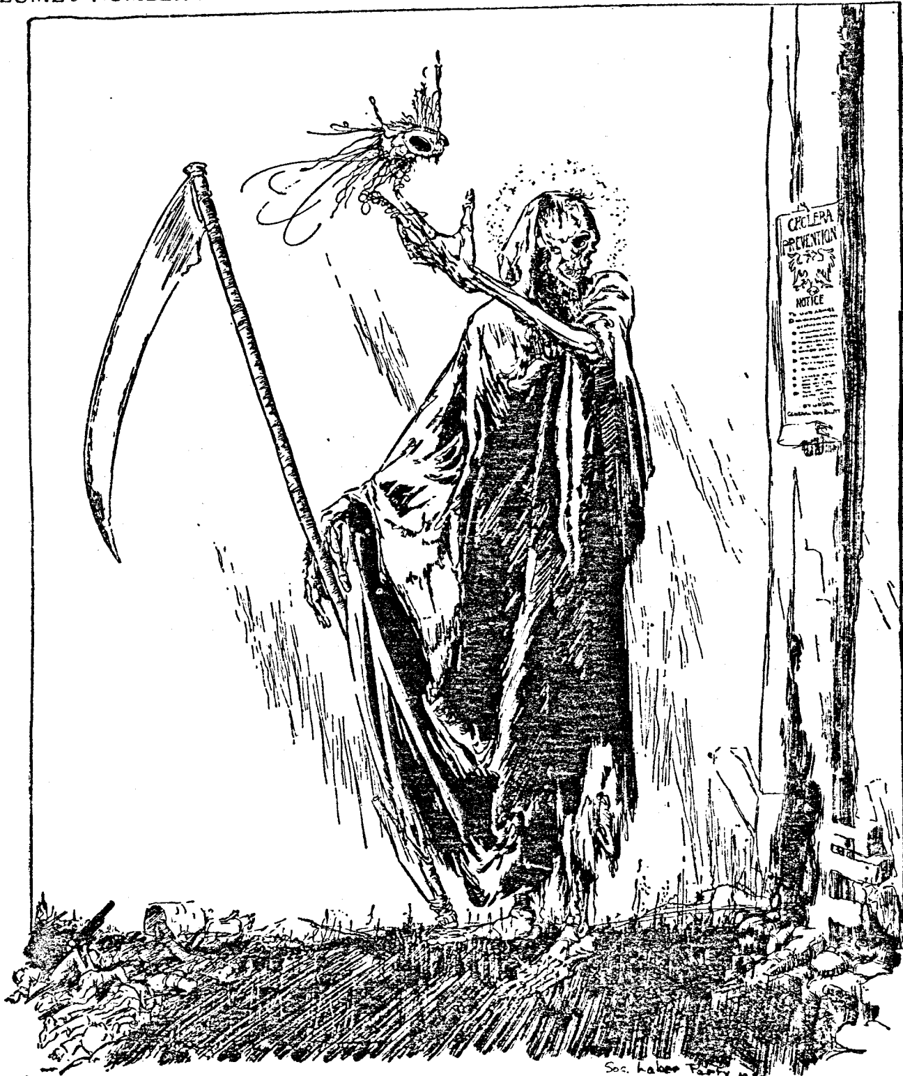
From war cartoons by Will Dyson.

“But war’s a game, which, were their subjects wise, Kings would not play at.”