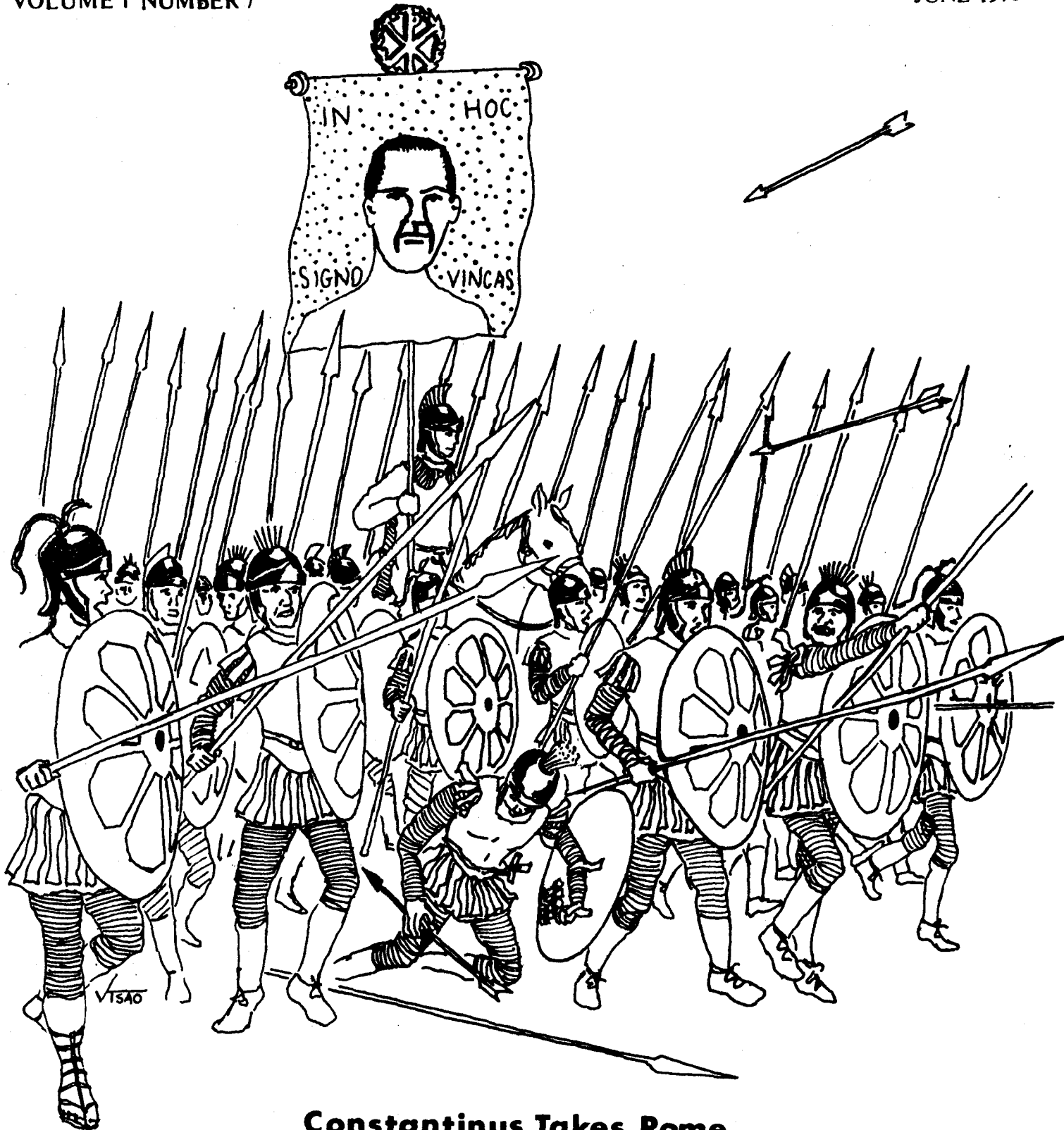
Constantinus Takes Rome