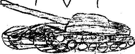
British Centurion (Jim Lawson)

Sinai is a Diplomacy gamezine published by your friend and mine, Greg Dority, our mutual friend can be reached at Greg Dority Subs 6/100 No games open now, tho check in a couple months. 302 W 15 St Wash NC 27889 919-946-4211