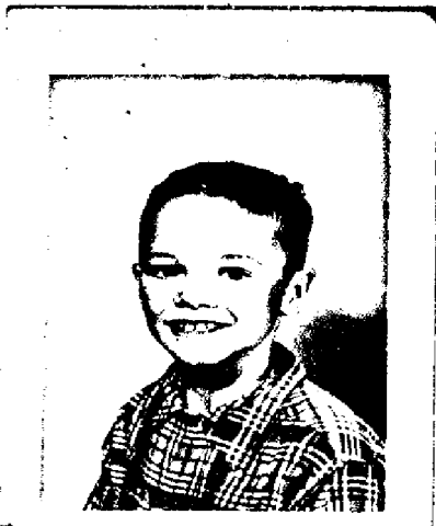
NICE KID (7)