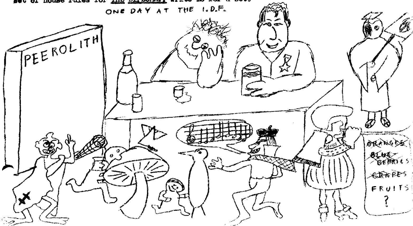
ONE DAY AT THE I.D.F.

Unfortunately, it's too late to do anything about the rule problems in 1967ED, but TDs 2&3 will have some refinements. For one I want stand-by players for both these games so that we do not have one player after another drop when it looks bad. Also, I plan to keep a scedual of 3 weeks for spring and fall, and 2 weeks for winter moves. If I start another game, there will be a game fee of $5.00. Speaking of rules, if you don't have a set of house rules for THE DIPLOMAT , write me for a set.